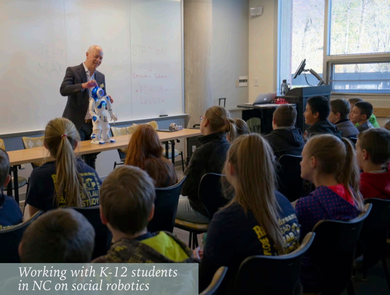
Working with K-12 students in NC on social robotics