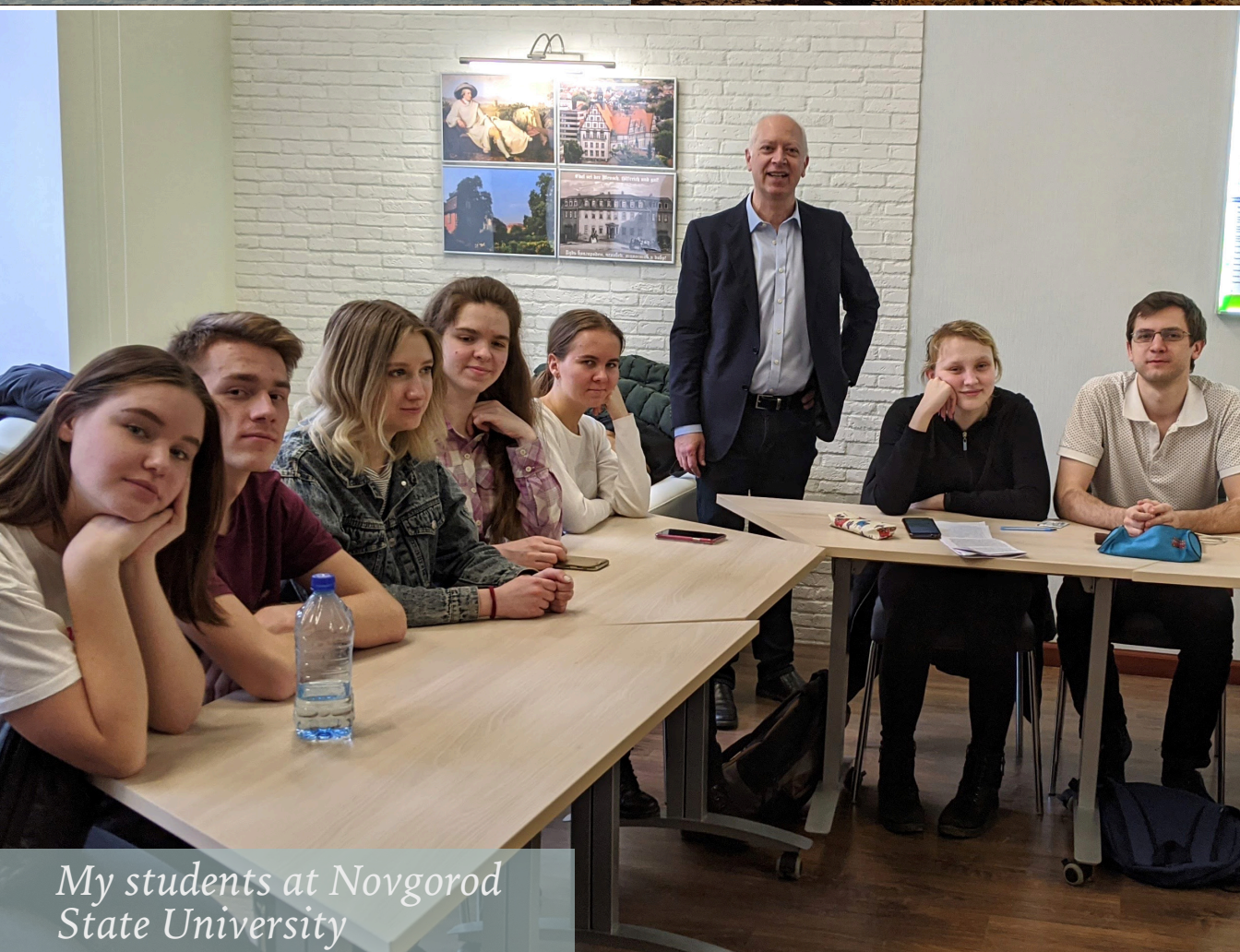
My students at Novgorod State University