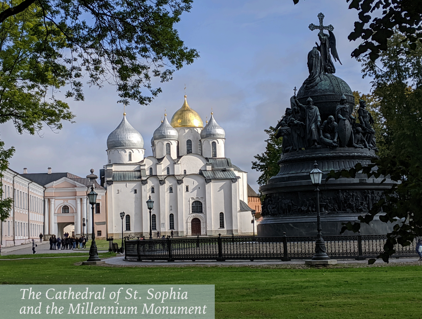
The Cathedral of St. Sophia and the Millennium Monument