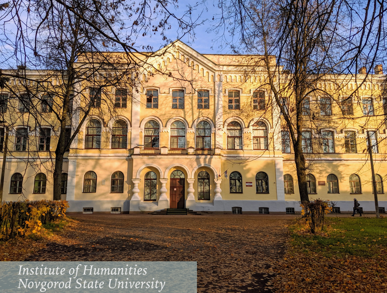
Institute of Humanities Novgorod State University